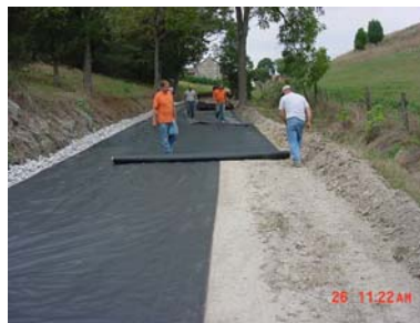
Dirt and gravel road pollution prevention starts with proper drainage

Each year, the State Conservation Commission allocates program monies to the York County Conservation District based on identified need