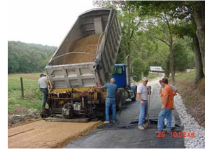
Environmentally sound dirt and gravel road maintenance practices save time and money