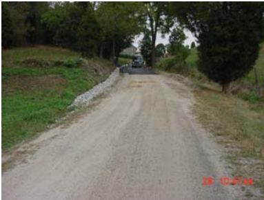
Dirt and gravel road runoff and sediment impact water quality