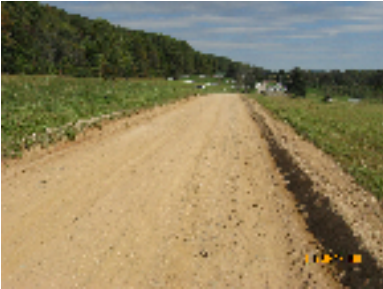
Dirt and gravel road runoff and sediment impact water quality