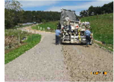
Environmentally sound dirt and gravel road maintenance practices save time and money