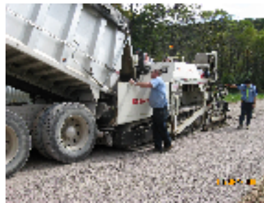
Dirt and gravel road pollution prevention starts with proper drainage

Each year, the State Conservation Commission allocates program monies to the York County Conservation District based on identified need