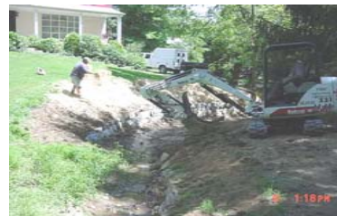
HELP-Streams headwater stream bank rehabilitation and protection project

The typical HELP-Streams projects may cost between $1 and $50 per linear foot of stream bank rehabilitated and protected. Cost varies between the project's length, your BMP choice, site conditions, and the economy. The Conservation District's Watershed Specialist can assist you with developing a cost estimate for your project.