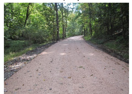
Below: Blymire Hollow Rd., North Hopewell Twp.—After DSA Placement