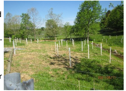
Above & Below: EXHIP Project After— Codorus Creek Watershed