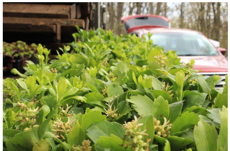
Above Right: Pachysandra order awaits pickup at drive-thru.

We look forward to the 2022 Seedling Sale for which we will offer convenient online ordering on our website.