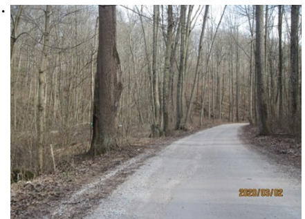
Above: Blymire Hollow Rd., North Hopewell Twp.—Before DSA Placement