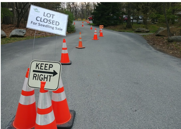
Below Left: A generous quantity of traffic cones directs customers to drive-thru pick up site at Rocky Ridge Park.