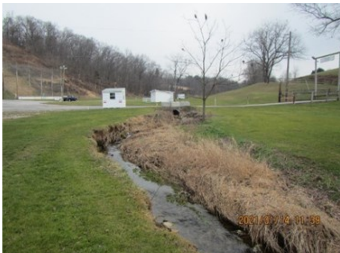
Above Left & Below Left:

Pre-Construction—Unstable, Actively Eroding Streambanks