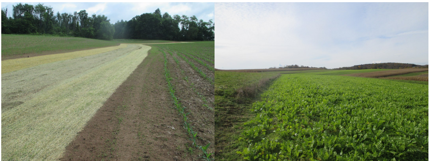
Above Left: Grassed waterway with erosion control netting installed at farm operated by Andrew Macklin—Exelon Funding