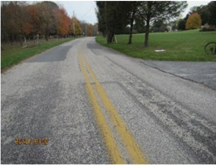
Above: Pre-Construction—Simpson Rd. degraded road surface