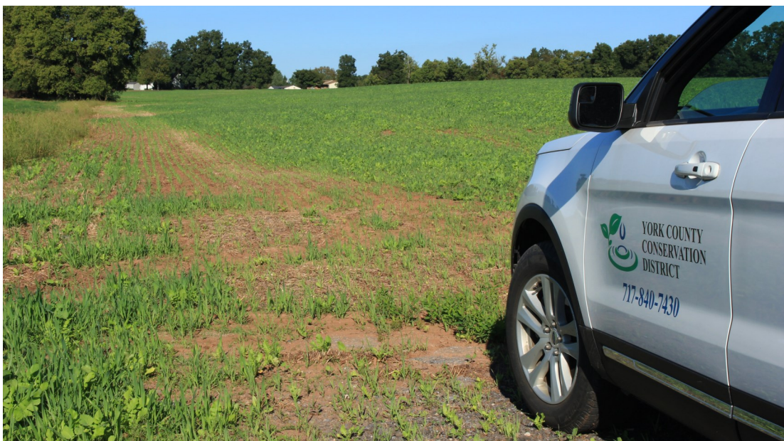
Above: YCCD vehicle at site visit to observe status of cover crop planting funded by CEG program