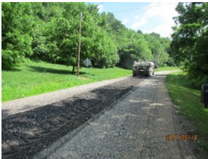
Below Right: Post-Construction—Simpson Rd. with new surface