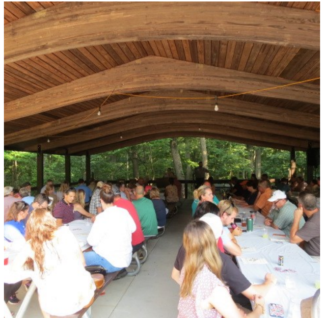
Above: Guests attend 2021 Conservation Awards Picnic

When YCCD moved to Pleasant Valley Road in 2020, we left behind our Memorial Garden at the former office. In 2021 we partnered with York County Parks and Deller Excavating to uproot our Memorial Garden and transplant it at our new office. An eastern redbud, the centerpiece of the memorial garden, was the first to make the transition as shown below. The redbud adapted well to its new setting and will soon be accompanied by a variety of other native plants.