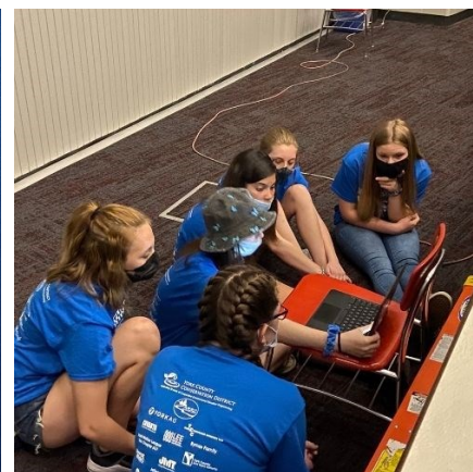
Above Left: Student catches bluegill after completing virtual station tests—Above Center: 2021 Envirothon T-Shirt—Above Right: Students complete virtual tests