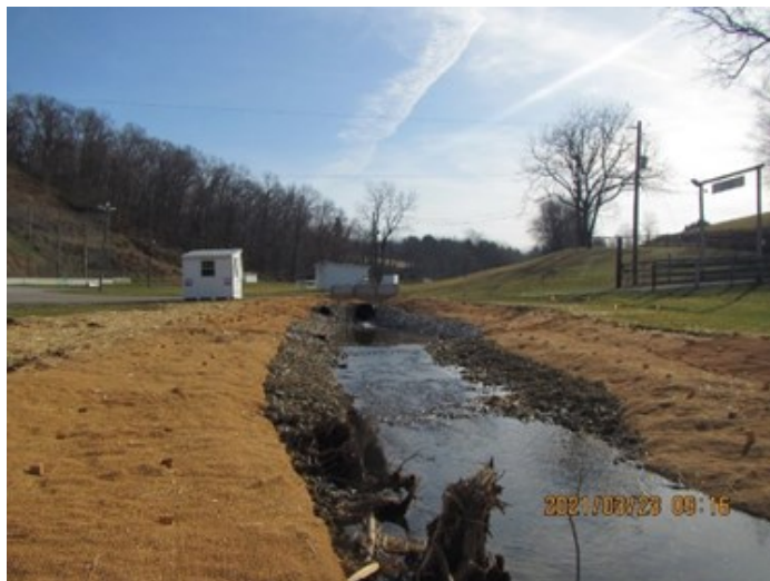
Above Right & Below Right:

Pre-Construction—Unstable, Actively Eroding Streambanks